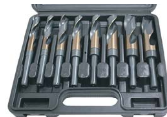
Item# H516-6507 $189.00/SET