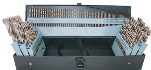
Item# 0422-1003 $299.00/SET