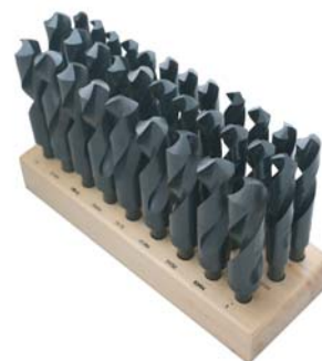
Item# H516-6506 $228.00/SET