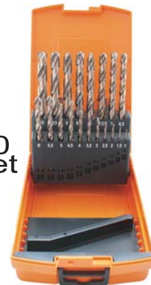
$60 00 set