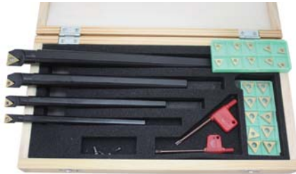
Item: P252-S412 (TCMT) $316.00/SET

31pcs set contains: 4pcs indexable boring bars(STUCR) 1pc each of 3/8", 1/2", 5/8" & 3/4". 10pcs TiN coated TCMT 21.5 inserts 10pcs TiN coated TCMT 32.5 inserts 4pcs torx screws 2pcs torx wrench 1pc fitted case