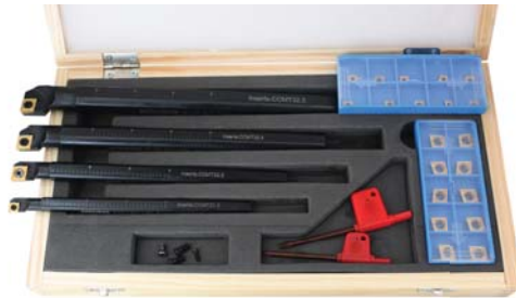
Item: P252-S410 (CCMT) $316.00/SET

31pcs/set contains: 4pcs indexable boring bars(SCLCR) 1pc each of 3/8", 1/2", 5/8" & 3/4". 10pcs CCMT 21.5 TiN coated inserts. 10pcs CCMT 32.5 TiN coated inserts. 4pcs torx screws. 2pcs torx wrench. 1pc fitted case.